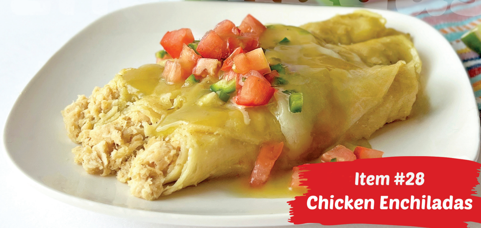
Item #28 Chicken Enchiladas