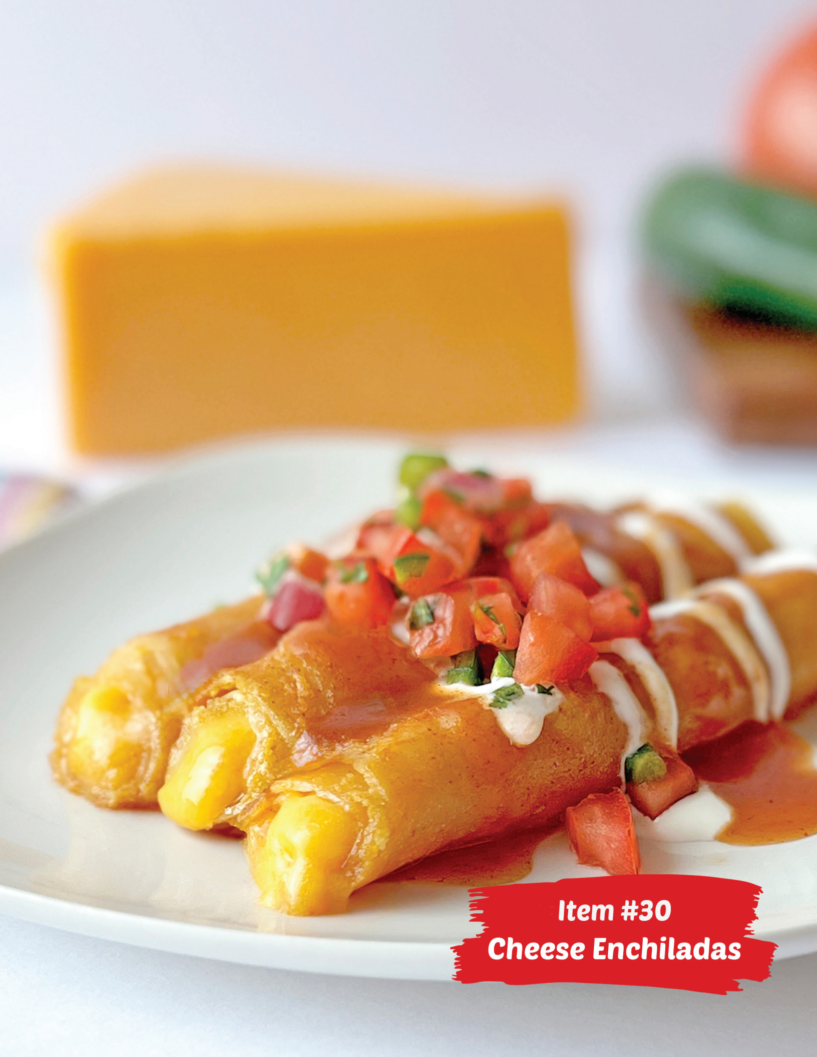
Item #30 Cheese Enchiladas