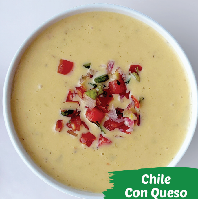
Chile Con Queso