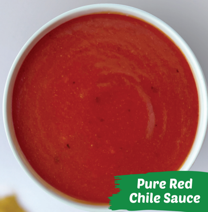
Pure Red Chile Sauce