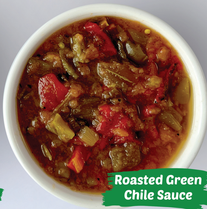
Roasted Green Chile Sauce