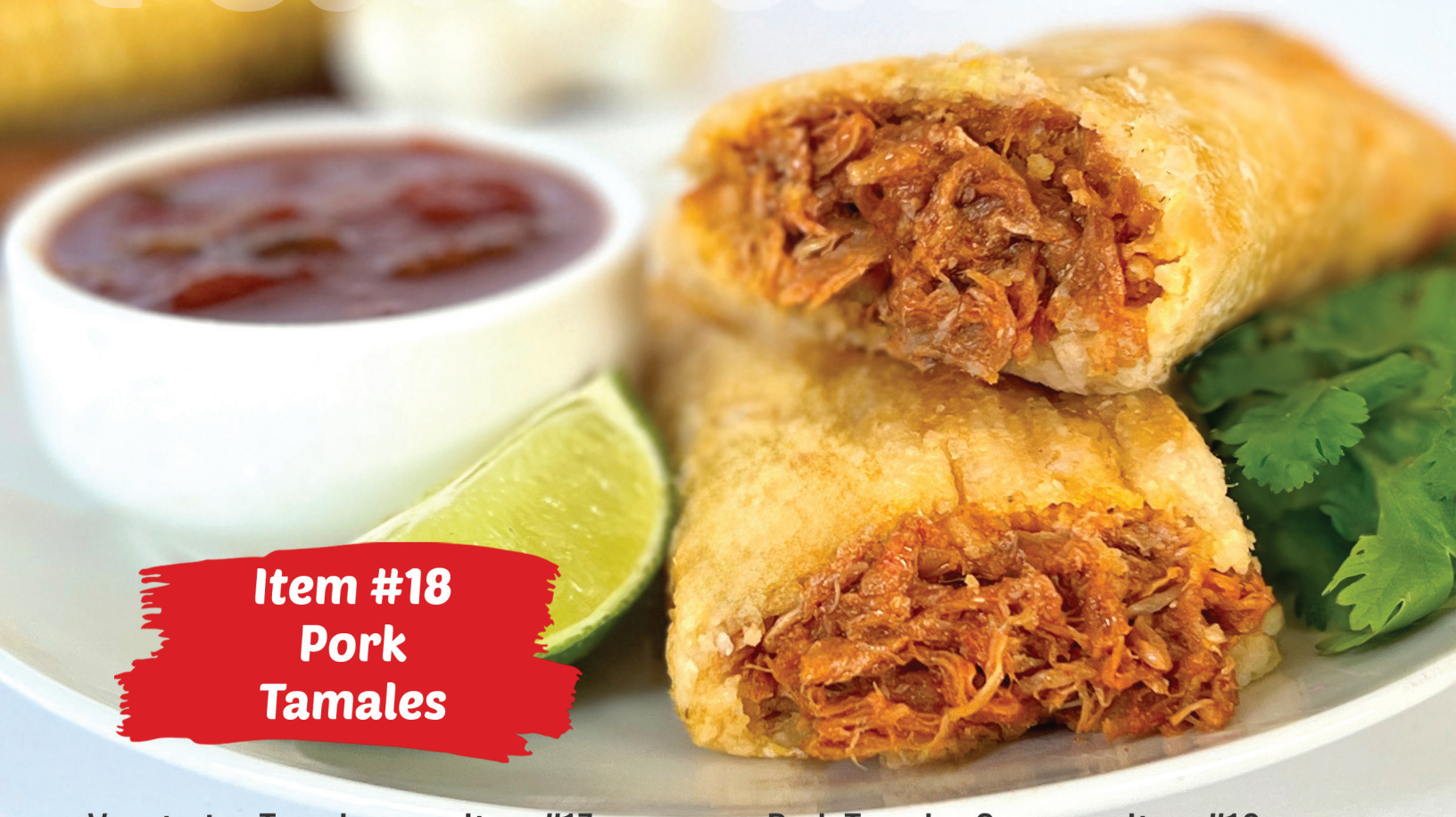
Item #18 Pork Tamales